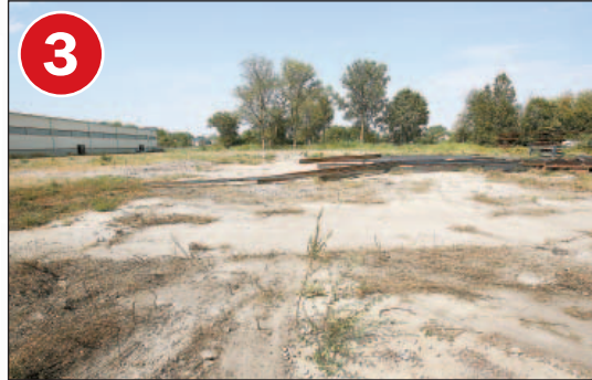
Titan Industries Inc. plating plant 2422 Yandes St.