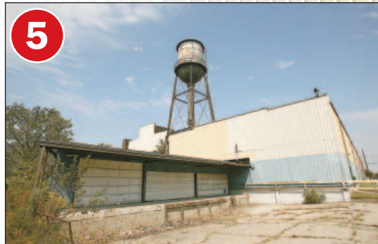
National Automobile Manufacturing Co. plant 1145 E. 22nd St.