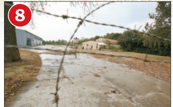
American Lead Corp. 2102 Hillside Ave.