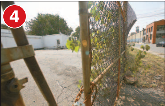
Production Plating Co. Inc. 2221 Yandes St.