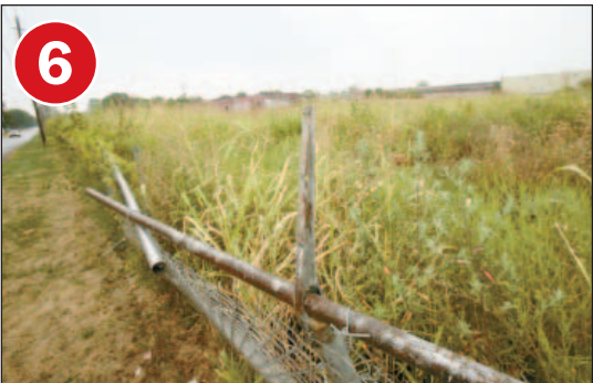
Douglas Little League site 2100 Ralston Ave.