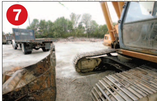
Linder Machine Co. Inc. 1502 E. 21st St.