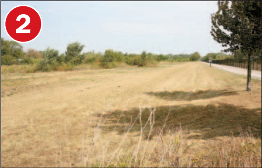
Railroad roundhouse 1100 E. 25th St.